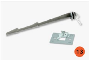
Can be secured to the ground or structures using the VM Surface Anchor (SA 1 ) or VM Ground Anchor (GA 1 ).