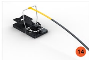
Replacement Traps Available Veseris #839107