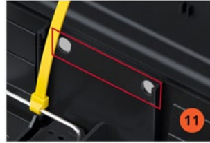
Install on fence lines with U-bolts.