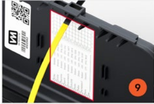
Ample room for internal documentation label inside.