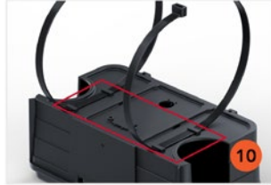
Flexible attachment solutions allow precise placement along rodent runways. Utilize zip tie slot system on bottom of station for horizontal or vertical attachments, including pipes and trees.