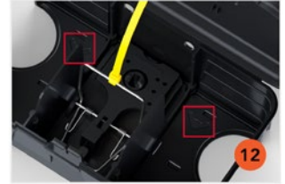
Thin plastic allows for easy puncture and installation of ground and surface anchors.