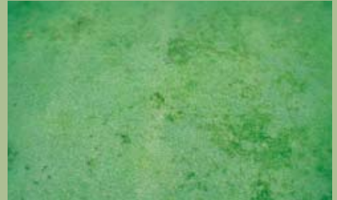
Green infested with silvery thread moss, untreated.