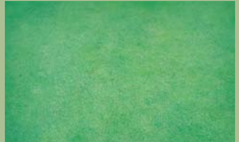
Green treated with two applications of QuickSilver at 6.7 oz/acre, 42 days after initial treatment.