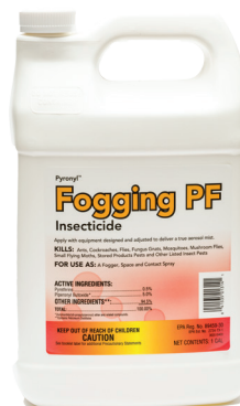
Pyronyl™ Fogging PF Concentrate Insecticide