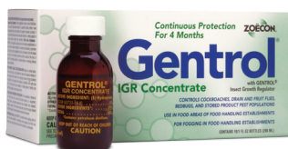
Gentrol® IGR Concentrate Insect Growth Regulator