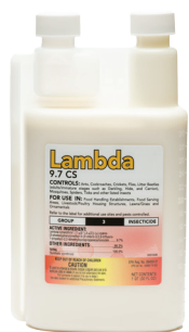
Lambda 9.7 CS Insecticide