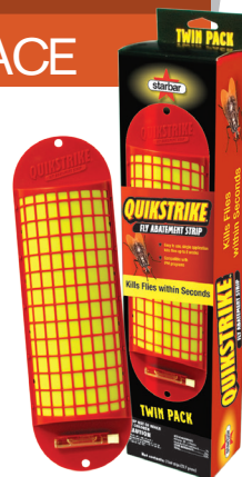
QuikStrike® Fly Abatement Strip Insecticide