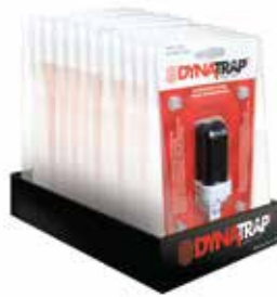
41050-R REPLACEMENT BULB CARTON