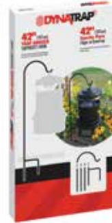
42010 Shepherd's Hook