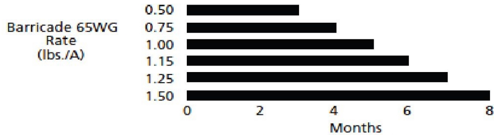
Figure 1: Length of Crabgrass Control*

*Length of control varies by region. This table is an average for planning purposes.