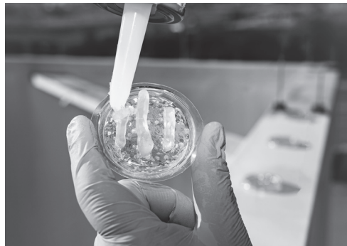
2. Apply Adhesive