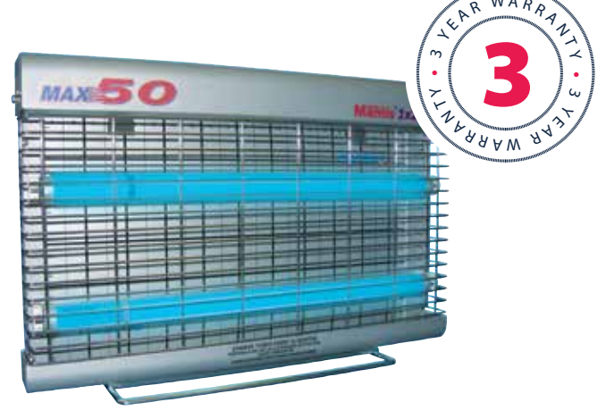
Shown with optional stand product code EF30STAND