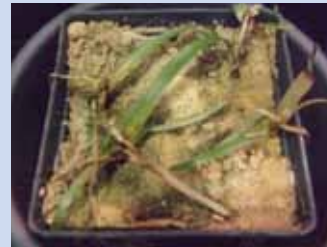
10 days after treatment