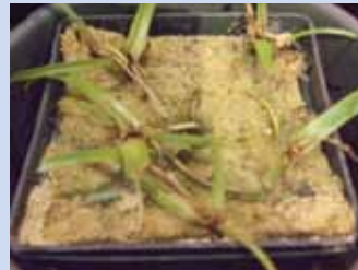
5 days after treatment

The doveweed images to the right demonstrate the type of dramatic results you can expect just days after a single treatment with Blindsight.