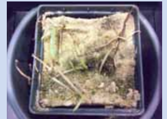
15 days after treatment

For optimal control, a second application may be needed 14 to 20 days after initial treatment.