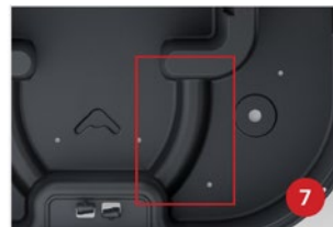
7 Internal half-moon shaped walls give high-level durability to the station and keep water out.