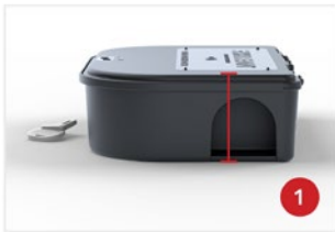
1 Low profile design.