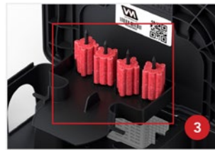
3 Accommodates four pieces of block bait.