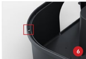
6 Drain holes throughout lid and base keep water draining out of station and away from bait.