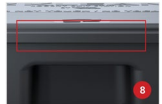
8 Raised lip around the front of the station deters unwanted entry.