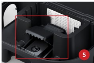
5 Accommodates the AP&G Catchmaster 621 snap trap.