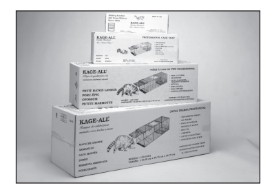
MULTI-LINGUAL PACKAGING For customer appeal and convenience