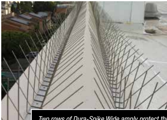
Two rows of Dura-Spike Wide amply protect this wide parapet cap.