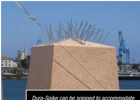
Dura-Spike can be snipped to accommodate smaller surfaces like this pillar.

Installation video at www.birdbarrier.tv