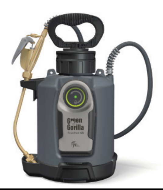
*configuration shown above