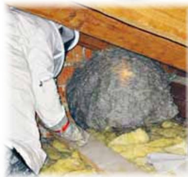
Pest control and garden