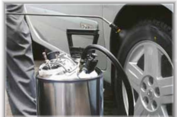
Commerce and industry