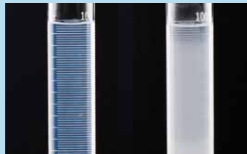
This image demonstrates the clear difference in consistency between Transport Mikron (left) and Demand® (right).

FMC has taken the powerful active ingredients found in Transport GHP and harnessed them in a highly advanced Mikron liquid formulation that’s completely clear once mixed, so it won’t leave a messy residue behind. What’s more, Transport Mikron doesn’t settle out like other formulations can, so you can be confident you’re maintaining even distribution of active ingredient throughout the tank — from the first job to the last.