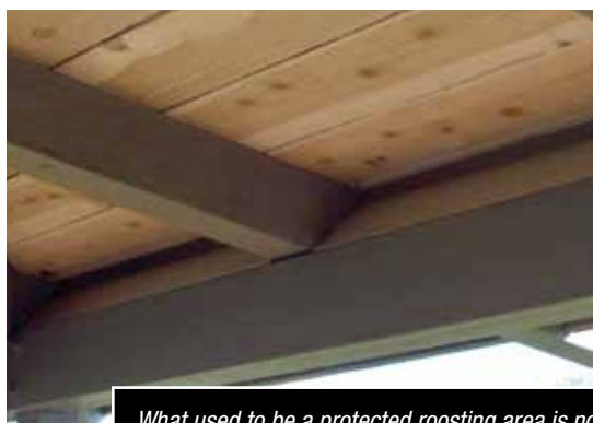
What used to be a protected roosting area is now completely protected. Birds can't even land here.