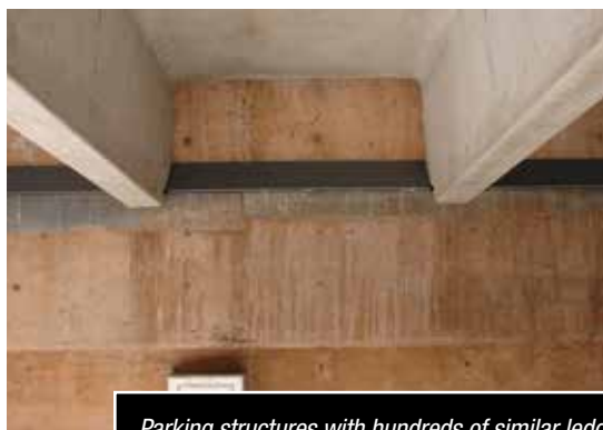
Parking structures with hundreds of similar ledges are fast and easy to protect with BirdSlide.

Installation video at www.birdbarrier.tv