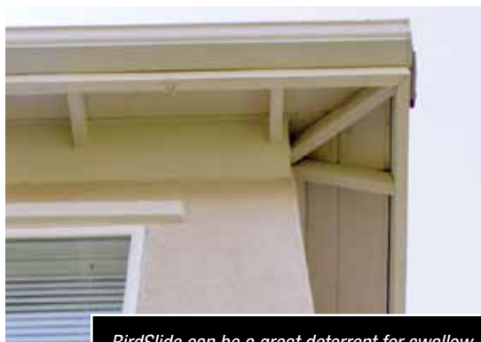
BirdSlide can be a great deterrent for swallow nests when it's installed at an inverted angle.*