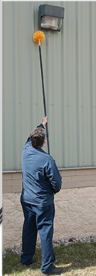
Remove Cobwebs And Nest Debris