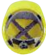
Fas-Trac® ratchet suspension