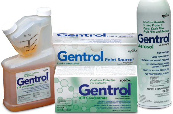
Gentrol® Family - Aerosol, Concentrate, and Point Source Synthetic insect growth regulators