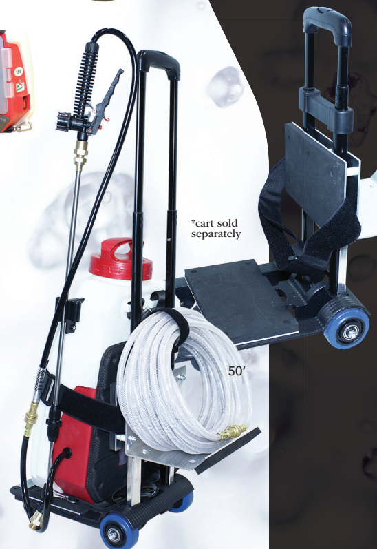
*cart sold separately