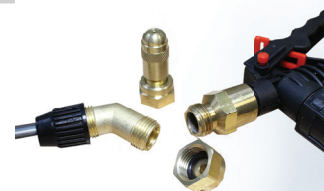
11/16 Standard thread size