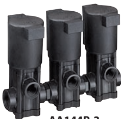
AA144P-3 (Three Unit)