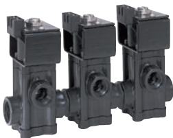
AA144A-3 (Three Unit)

To order, specify AA144A- then "1", "2" or "3" to indicate number of units. Example: AA(B)144A-3