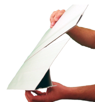
Bird Slope Extender

To install: Surface should be clean and dry before installation. Bird Slope™ covers a 5.5" ledge; for larger ledges slope extenders are available. Can be glued onto surface using glue troughs. End caps should be installed to prevent birds from getting behind the Bird Slope™.