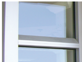
Installed on window sills