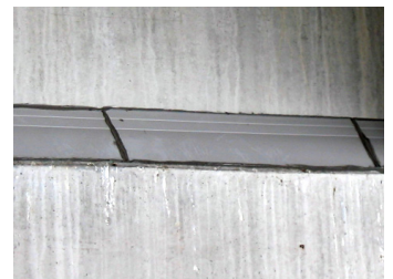
Installed in parking structure

To install: Surface should be clean and dry before installation. Bird Slope™ covers a 5.5" ledge; for larger ledges slope extenders are available. Can be glued onto surface using glue troughs. End caps should be installed to prevent birds from getting behind the Bird Slope™.