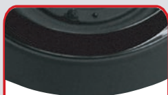
Black Is Shown To Attract BedBugs