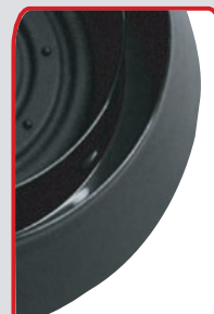
Powderless Deadfall Trap