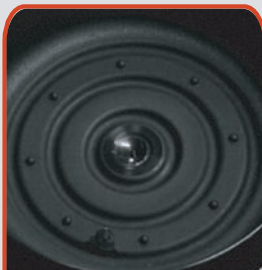
Guards To Keep Bed Wheels Stable