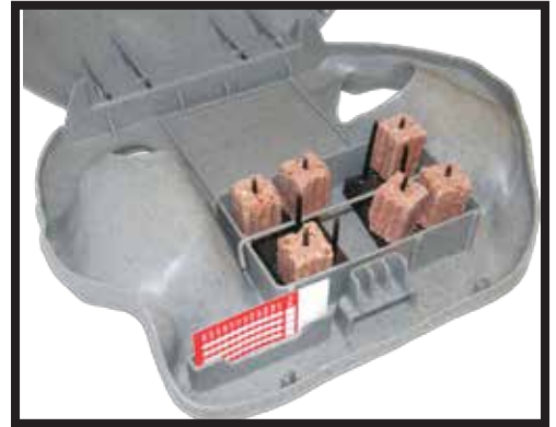
Use With Green's Vertical Bait Holder