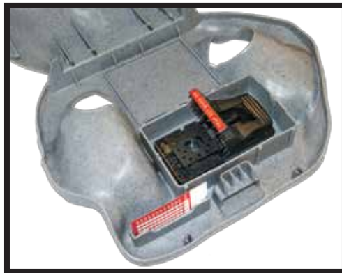
Insert JAWZ™ Rat Trap In Bait Well