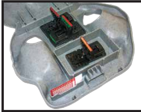
Place JAWZ™ Mouse Traps In Wells