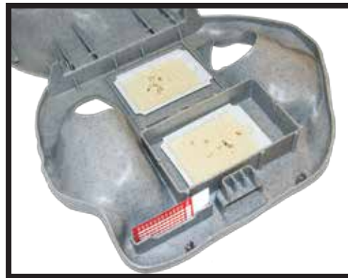
Use With STICK-EM® Mouse Glue Traps