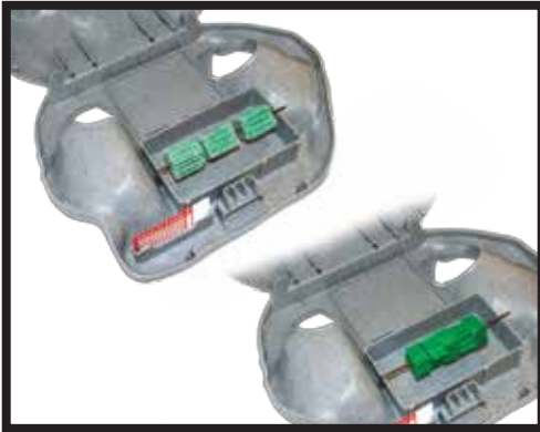
Use With 1 oz. BAIT BLOCK®, .5 oz. TOP GUN BAIT BLOCK® Or NECTUS™ Soft Bait