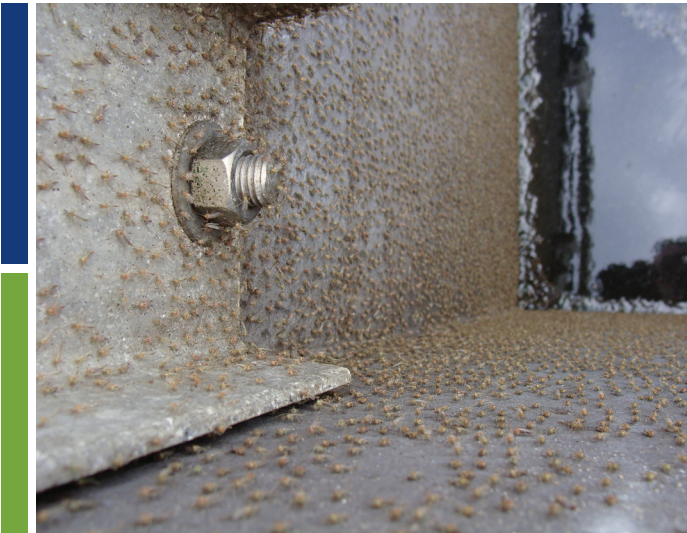
Adult midges emerging from water

Midge and filter flies are more than a nuisance to the staff and surrounding neighbors of wastewater treatment facilities. Their aquatic larvae consume beneficial organisms, deplete water of oxygen and create floating mats of larval and pupal casings. In severe infestations they can alter water quality, clog pipes/equipment, transmit pathogens and generate complaints from surrounding properties. Controlling these pests is essential to keeping a wastewater treatment facility operating efficiently.