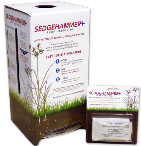
Sedgehammer+ Common Bermudagrass - Purple Nutsedge North Carolina State, Plymouth, NC