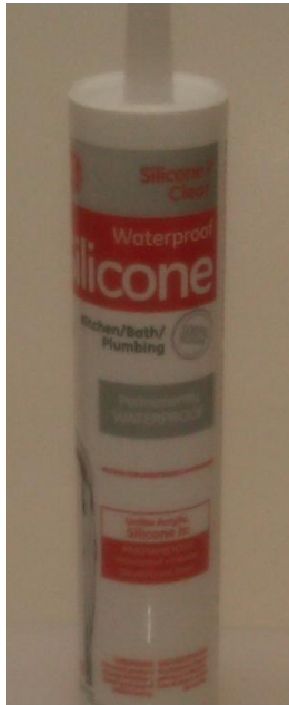
Tube of Clear, Waterproof Bath and Tile Silicone / Putty Knife

This is a fast and cost-effective method of sealing these porous surfaces