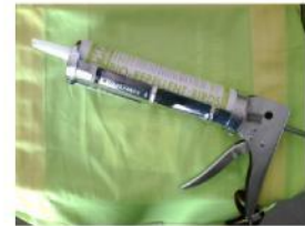
D. Load Caulking Gun

Use on parapets, ledges, windows, beams, patio covers, conduit, walls, barns, pipes, under tiles, roofs, under HVAC units, holes, under roof line, lights.