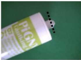
A. Cut Nozzle