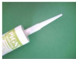
B. Attach Applicator