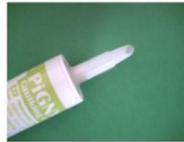
C. Cut Applicator