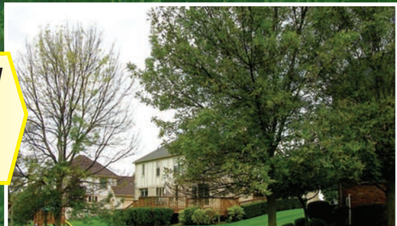
Untreated tree (left) is severely damaged by Emerald Ash Borers while treated tree (right) is healthy

10 years and counting of successful Emerald Ash Borer treatments