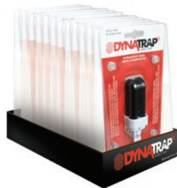
41050-R REPLACEMENT BULB CARTON